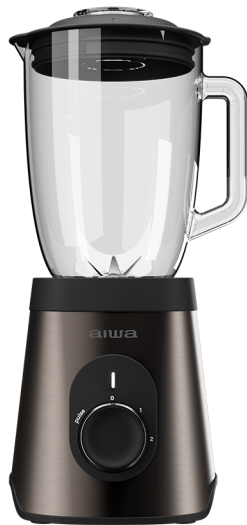
TABLE BLENDER KITCHEN SOLUTIONS