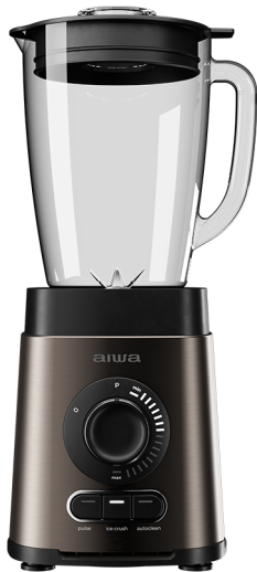
TABLE BLENDER KITCHEN SOLUTIONS