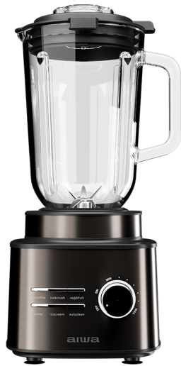
TABLE BLENDER KITCHEN SOLUTIONS