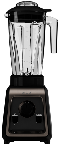
TABLE BLENDER KITCHEN SOLUTIONS